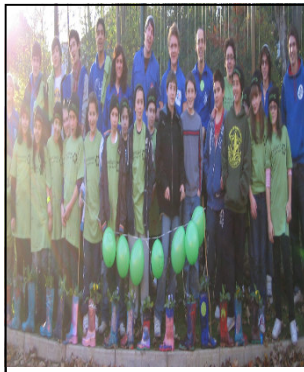
Wellies on display in Manchester