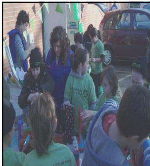
Chanichim frantically painting their wellies in Manchester on Sunday