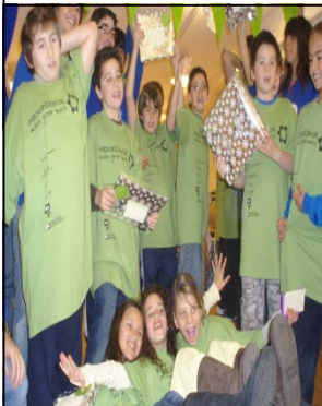
Our London chanichim wrapping presents for Barnados.

To wrap up, Mitzvah Day was a huge success and we would like to thank everyone who got involved to help make the day run smoothly. We look forward to helping out next year!